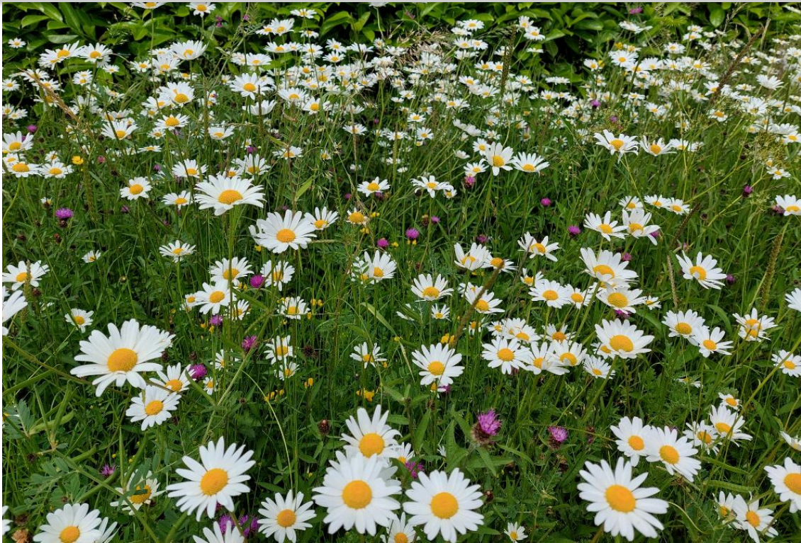
Wildflower border alongside the car park near the Robert Hooke building, The Open University, May 2024